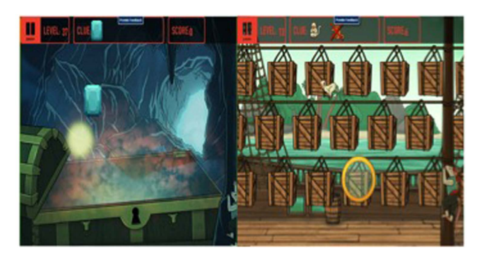
Figure 2. Two User Interfaces for the General Executive Function Brain Training Game. Left panel is the version where the child follows the moving light and clicks on it when it turns into a jewel that meets the criteria for being a target. There are two moving lights at the game level shown, and at the moment of the screen shot one has just turned to a blue jewel. The clue at the top of the screen shows that the target is blue jewels. The right panel is second user interface for the same cognitive demands and computer code. At the moment of the screen shot, the moving lens (yellow circle) has just revealed a target monkey in the crate, the child has clicked on it and monkey is freed from the crate and is running away. Computer code for the games was created with the text editor Sublime (https://www.sublimetext.com/) and art work created in Photoshop (http://www.photoshop.com/).

potentially artificially increasing average improvement in both BT and control groups. Such an effect could have reduced the difference between BT and control groups.